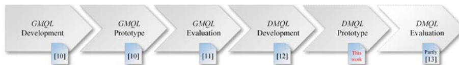
Figure 1. Overall development process

To focus on real-world problems and continuous improvement, we followed the Design Science methodology of PEFFERS ET AL. [9]. We proposed a model query approach under the objectives of wide applicability, independency of modeling languages, support of difficult and complex issues, and, at the same time, an appropriate ease of use [10]. This resulted in the Generic Model Query Language (GMQL) , which is based on set theory. Consisting of functions and set operators, it works independently of a modeling language and supports querying complex structural patterns (examples in [8]). An evaluation confirms the power and the utility of GMQL but also its amendable ease of use [11]. Though being generally applicable, the approach is inconvenient and overly complex, which prevents the application in practice.